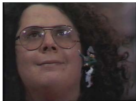
(2) 200 Motels (Frank Zappa, 1971)

In the same way, there are a number of visual and narration effects in 200 Motels (repetitions, association of ideas, symbolism, etc.) that we can find in Vertov's film. While Vertov portrayed a day in the life of a Soviet city, Zappa portrays the stereotypes