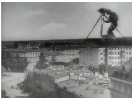
(1) Man with a Movie Camera (Dziga Vertov, 1929)

One of the clearest inspirations for Zappa can be seen in Man with a Movie Camera (Dziga Vertov, 1929). Zappa shows different characters in the role of filmmaker or cameraman, in a similar way to Vertov. In his film, Vertov showed the cameraman filming the city (image 1) using superimposition effects – we see the same effect in the scene where Rance Muhammitz (an alter ego of the filmmaker) gives orders to Mark Volman in Zappa's film (image 2).