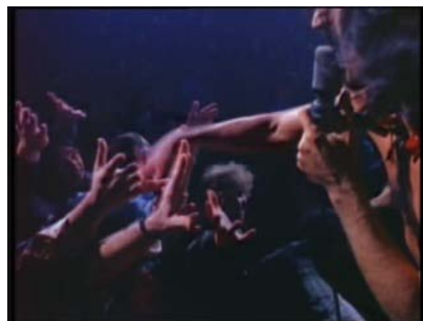
(5) The Last Waltz (Martin Scorsese, 1978) (6) Baby Snakes (Frank Zappa, 1979)

During the rest of his film production, Zappa will go into these ideas in depth, avoiding the temptation of falling into nostalgia. In his movies from the 80s (such as Video from