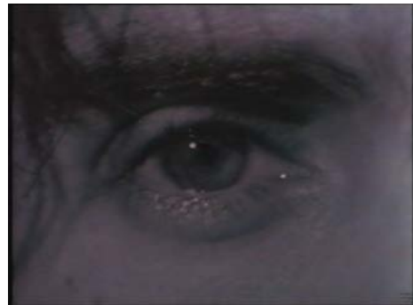
(3) Man with a Movie Camera (Dziga Vertov, 1929) (4) 200 Motels (Frank Zappa, 1971)

This appeal to the addressee becomes even more explicit in his next movie, Baby Snakes (1979). While a tour of rock concerts was the starting point in his first movie, the rock concert itself is the main subject in this one – Zappa will complete his reflection on musical creation when he talks about the process of editing material in his third film, The Dub Room Special! (1982). Zappa sees the rock concert as a space for political action using humor and entertainment. His most political overt activities would arrive with his 88 tour (when gives out voting registration forms for his young American audience to vote during a presidential election year), but we already find this dimension of his work in Baby Snakes . There is one specially relevant moment in the movie when Zappa plays a performance on stage with some members of the audience, using humor to show the way music industry abuse their artists. In this performance, Zappa expresses his ideas,